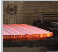
The injector begins life either as an alloy steel forging or steel bar.

Injector part failure due to wear is a costly hazard, leading to potential damage to other areas of the engine. The diesel injectors shown in this example are used in trucks, and each truck can have between 6-12 injectors. As part of the manufacturing process, the part must go through various thermal processing stages to enable it to perform to the required standard in service.