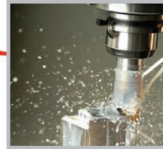
The injector is rough machined to within tight tolerance of its final size, adding fuel ports and passageways.

Controlled gas nitriding gives the part very high surface hardness with minimum distortion, providing excellent wear and corrosion resistance.