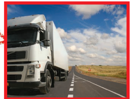
End application – truck engine

Due to the nitriding process, minimal finishing operations are needed. The part undergoes finish grinding and lapping to its final size.